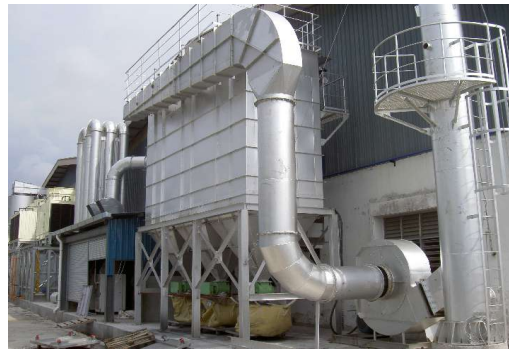
Air Pollution Control System for Metallurgical Plant