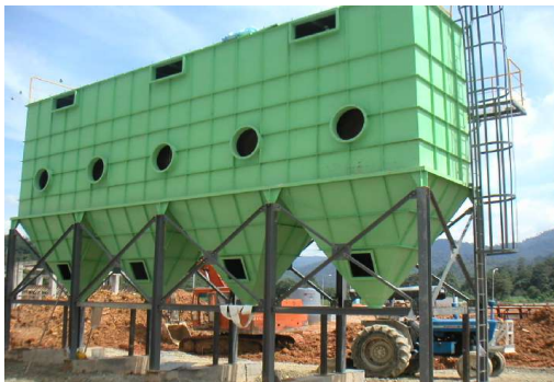
Bag Filter Dust Collector