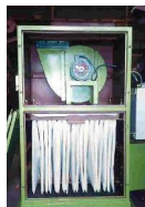
Shaker Type Dust Collector